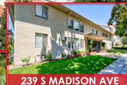
239 S MADISON AVE