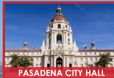
PASADENA CITY HALL