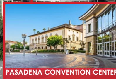
PASADENA CONVENTION CENTER