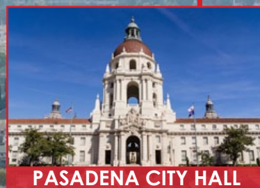
PASADENA CITY HALL