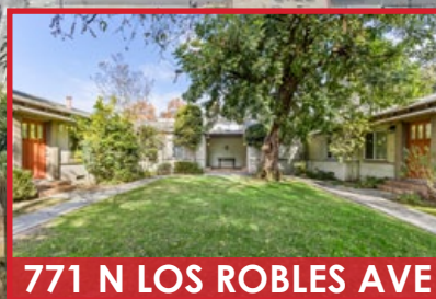
771 N LOS ROBLES AVE