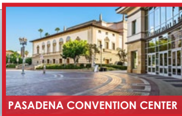
PASADENA CONVENTION CENTER