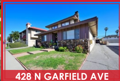
428 N GARFIELD AVE