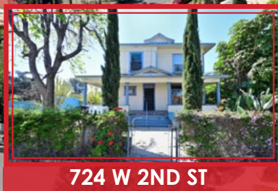
724 W 2ND ST