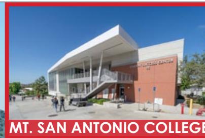
MT. SAN ANTONIO COLLEGE