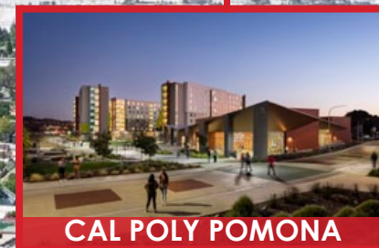
CAL POLY POMONA