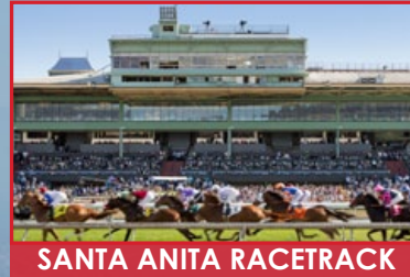
SANTA ANITA RACETRACK