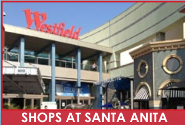
SHOPS AT SANTA ANITA