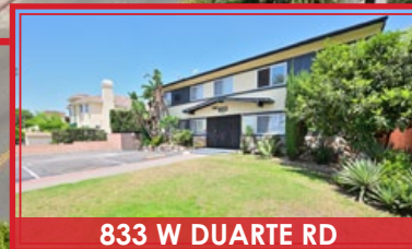
833 W DUARTE RD

Most errands can be accomplished on foot.