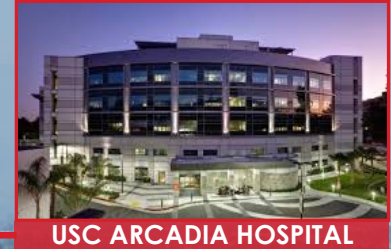
USC ARCADIA HOSPITAL