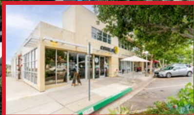
138-140 W SIERRA MADRE BLVD