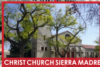
CHRIST CHURCH SIERRA MADRE