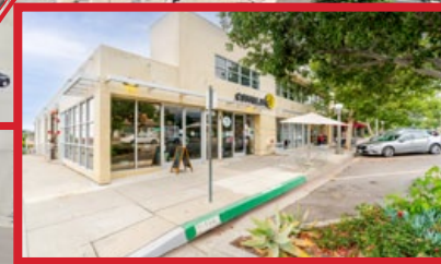
138-140 W SIERRA MADRE BLVD