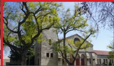
CHRIST CHURCH SIERRA MADRE