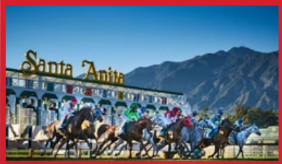
SANTA ANITA PARK