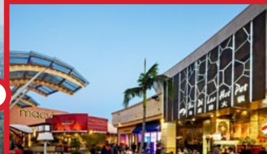
THE SHOPS AT SANTA ANITA