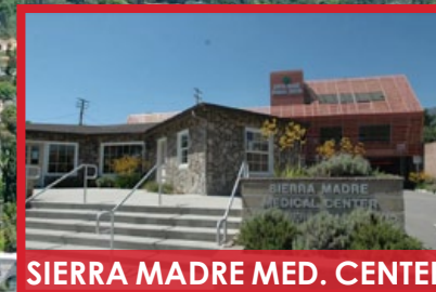
SIERRA MADRE MED. CENTER