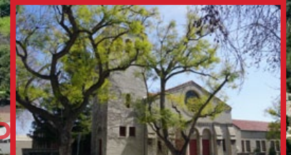
CHRIST CHURCH SIERRA MADRE