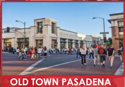
OLD TOWN PASADENA