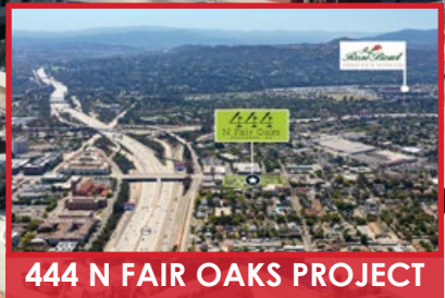
444 N FAIR OAKS PROJECT