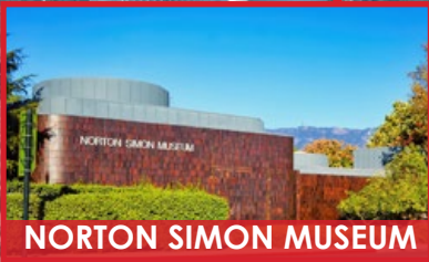
NORTON SIMON MUSEUM