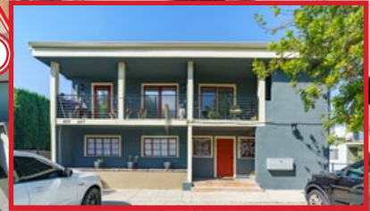
425 N RAYMOND AVE