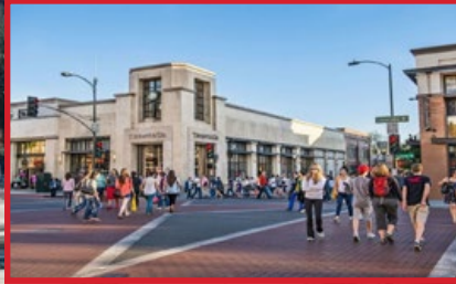
OLD TOWN PASADENA