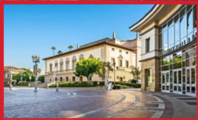
PASADENA CONVENTION CENTER