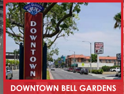
DOWNTOWN BELL GARDENS