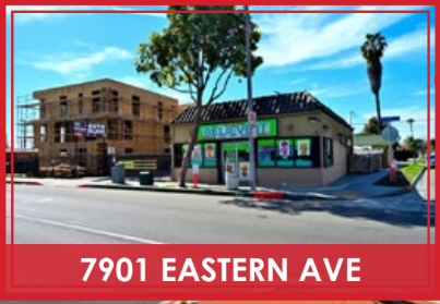
7901 EASTERN AVE